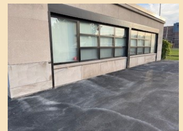
Before (left) and after (right) photos of School inlay replacement.