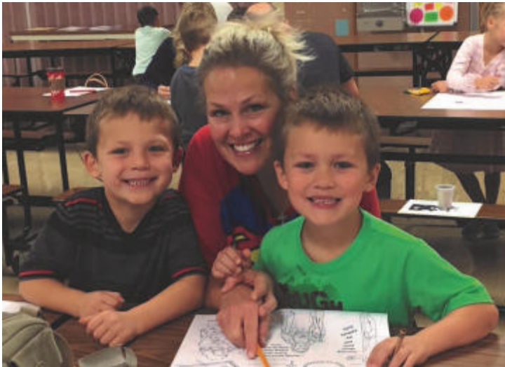
First Graders will be having their Family Celebrations on September 24, 26 and 29 during classes. (Photo is from last year's Family Celebration)

Disciple Camp First Friday Club: All Disciple Camp students and their friends are invited to our First Friday Club on Friday, October 5, from 7:00 – 9:00 pm in the School Gym/Cafeteria.