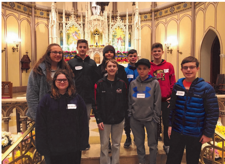
FFF Seventh graders went on a field trip to the Church of St. Louis.

www.stgregs.org/register-now/ Find the program of your choice and depending on the program, you will either be able to download a form to bring to the registration meeting, OR you will see a link to register online. Links will be live on the dates as per the registration schedule.