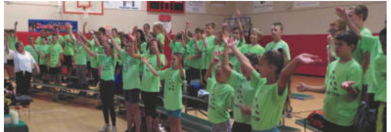
Hamming it up and having a good time during Music.