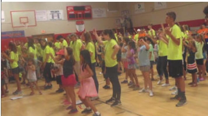
During Disciple Camp, the morning begins with prayer and music .