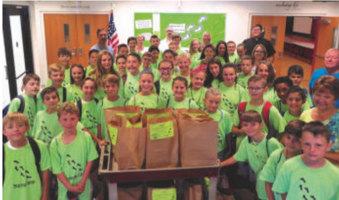
Disciple Camp Students brought in soup cans ("Meals in a Can") and other non-perishable food for the St. Vincent DePaul Food Pantry.