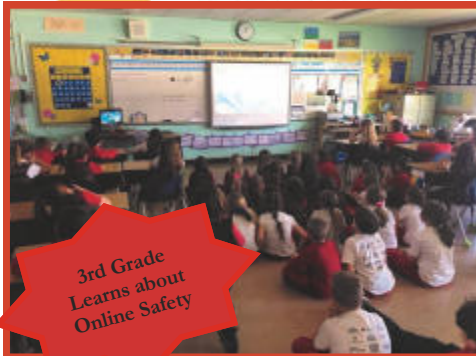
3rd Grade Learns about Online Safety

Grade 3 Students watched and discussed Disney's Wild About Safety video. They reviewed online safety and valuable tips on how information online is not always private, and once it is online, it is permanent and out of our control. Other topics discussed: