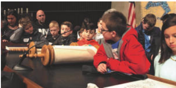
FFF Sixth went on a field trip to Temple Beth Zion, to learn about the faith that Jesus practiced.