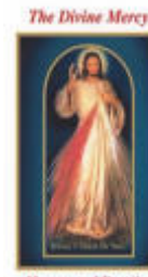
Message and Devotion