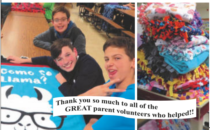
Thank you so much to all of the GREAT parent volunteers who helped!!