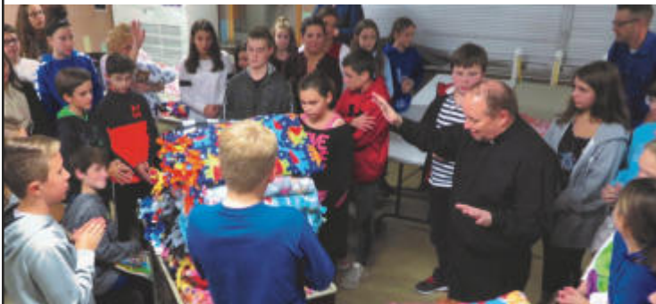
Blanket Making Service Project by FFF Gr 5-8 for Harvest House and the Child Advocacy Center. 44 blankets were made !!